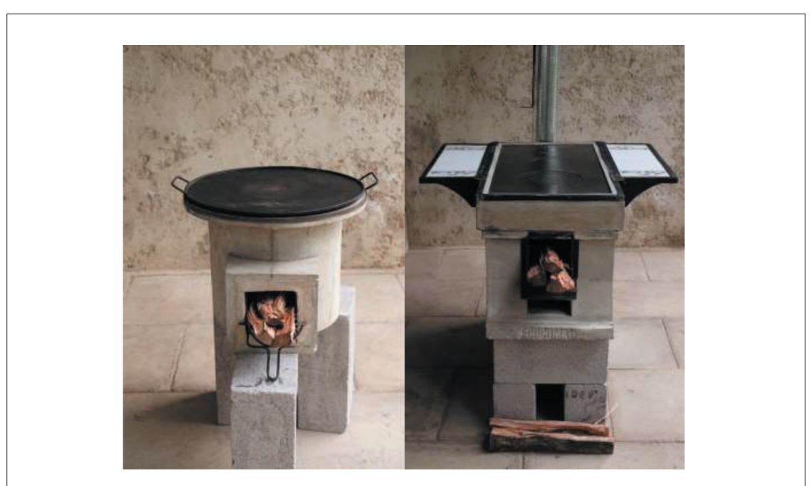
Figure 3. A) Ecocina cookstove (left) and B) EcoPlancha cookstove (right).

StoveTeam participates in multiple outreach events each year and regularly hosts service-learning trips for volunteers and students. Participating group itineraries may include cultural exchange, Spanish language immersion, leadership training and development, storytelling, photo-journalism and videography. In keeping with StoveTeam's mission of bringing stoves to communities and supporting local factories, StoveTeam requires each volunteer to support the cost of purchasing and distributing two Ecocina cookstoves (Figure 3A, http://www.stoveteam.org/projects/our-stove).