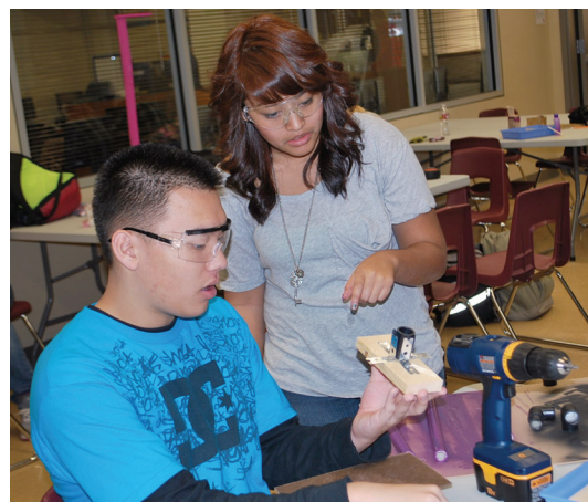
First-year CU-Boulder students brainstorm on the best solution for improving an electrical device for their capstone engineering project.

The University of Colorado admitted eight Skyline High School