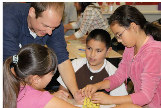
Fifth grade TEAMS graduate engineering fellow teaches elementary students how engineering can help lessen the impacts of natural disasters.

In 2004, the Integrated Teaching and Learning Program in the University of Colorado Boulder's College of Engineering and Applied Science identified the student populations of the Lafayette, Colorado-area schools and the Denver School of Science and Technology as the focus of its GK-12 engineering initiative. Their goal, to improve science and math literacy and increase the number of high school students prepared to choose an engineering and/or technology